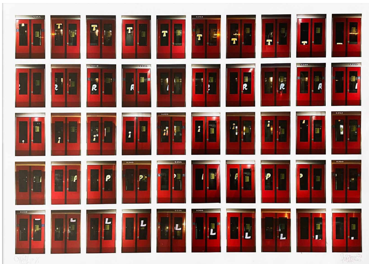
Figure 8. Image of the TRIPL's print 50 Doors of Rotterdam (2023), documenting sequential graffiti painted on individual train doors.

Wall-painted animation forges critical links across previous case studies. Miles's short films express Writing's aspect of interaction with urban space, echo works as Muto (Blu, 2008) and Big Bang Big Boom (Blu, 2010), animate figures engage with the city. Like Lorenzo's Urban Sphinx , which sequences still images into a fluid archive, BLU's palimpsest layers traces of past frames to stratify urban memory. Moreover, his persistent-frames anticipates TRIPL's 50 Doors of Rotterdam , where successive train graffiti photographs combine into a single print (see Figure 8), illustrating the collapse of static and moving image, physical and digital territories in animation-based documentation.