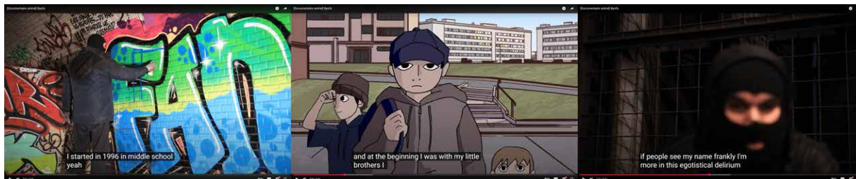
Figure 3. Still frames from Byofa (Bechet, et al., 2023).

and employing animation's inherent flexibility to render the intangible—dreams, sensations, memories—this hybrid strategy shifts emphasis from the graffiti piece itself to the inner motivations and emotional landscape that drive graffiti Writing practice (Honesty Roe, 2013). In contrast to Miles' 'time-compression' of real-time processes and Lorenzo's static archive's stop-motion animation, Byofa (Bechet, et al., 2023) interlaces three temporal modes: present-day footage of tunnel painting, animated memories of formative moments, and synchronous oral testimony (see Figure 3). This stratification creates a multi-layered narrative preserving chronological flow while communicating graffiti Writing's sociocultural context.