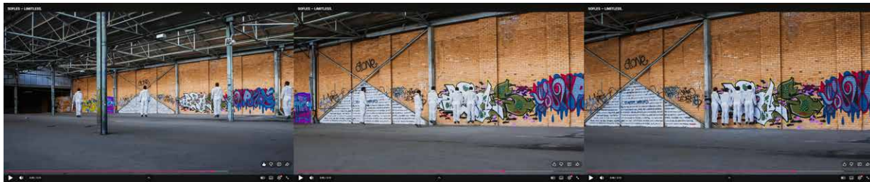
Figure 1. Still frames from SOFLES – LIMITLESS (Miles, 2013b), created using pixilation, sequence photographs of the subjects jumping in unison to produce the illusion of levitation.

generate movement illusion through frame-by-frame photography during playback.