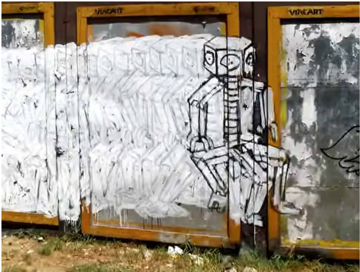
Figure 6. Still frame from Blu’s MUTO (2008) illustrating the seminal, destructive wall-painted animation result in which each successive image is painted over its predecessor, leaving a residue that traces the movement.

In 2022, BLU returned to wall-painted animation with Sensemurs , a project supporting community resistance against Valencia’s port expansion (Abarca, 2022; Ebert, 2022; Lorenzo, 2022). This marked a significant methodological evolution, introducing what can be