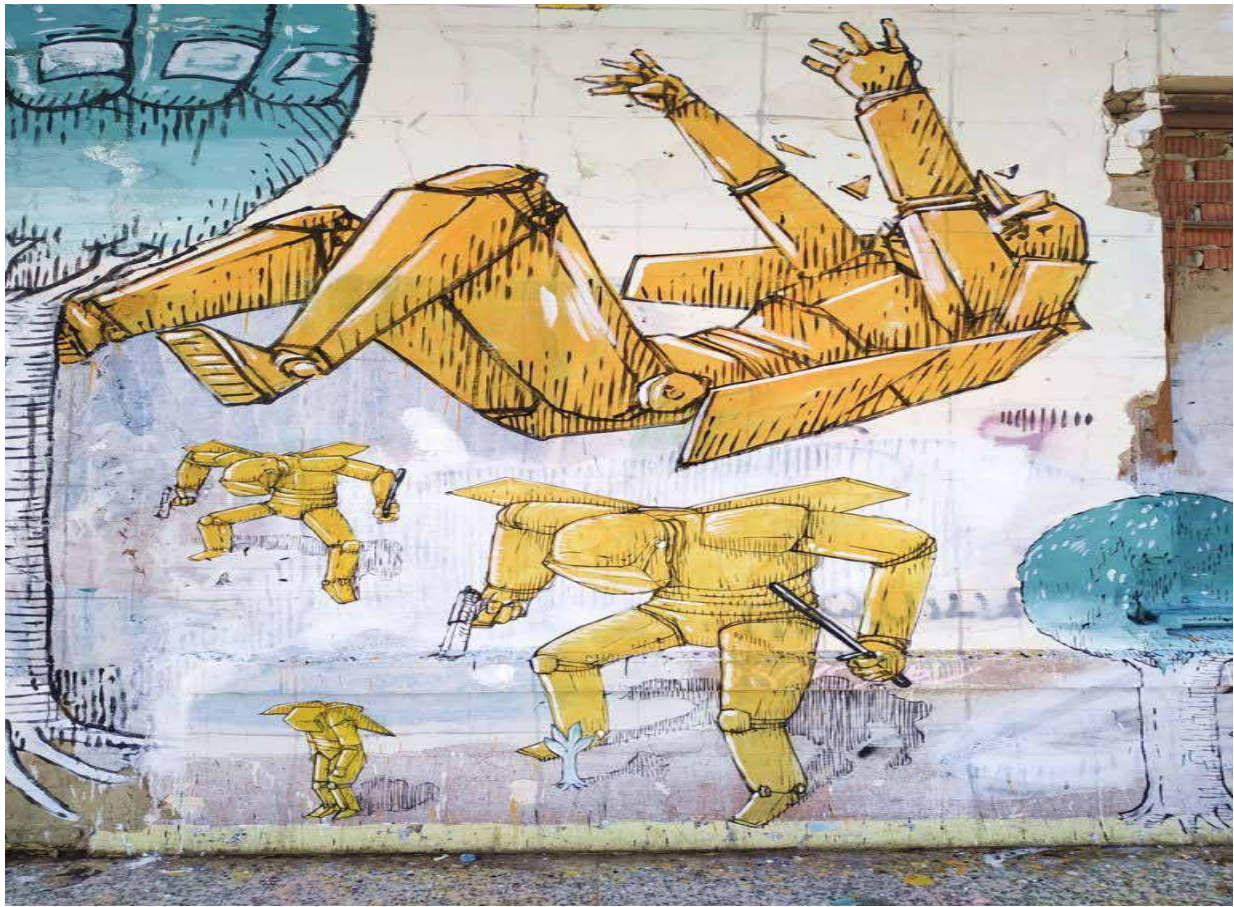
Figure 7. Portion of BLU's Sensemurs mural showing multiple coexisting frames that sequenced together will form part of the stop-motion animation.

termed 'persistent-frames'—an approach to wall-painted animation that fundamentally challenges conventional temporal sequencing. Unlike his earlier destructive method, where each frame obliterates its predecessor, this approach allows all animation frames to coexist physically and simultaneously distributed on the same surface (see Figure 7) (Abarca, 2022).