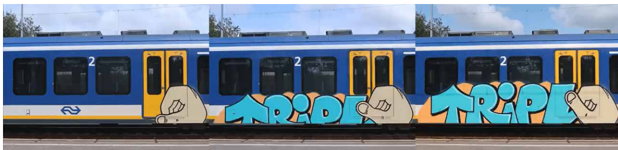
Figure 9. Still frames from TRIPL's train-writing animation Watching My Name Scroll By (2024).

Souza, 2018). As demonstrated in Miles's collaborative documentaries, TRIPL's approach employs a form of temporal compression—albeit under extreme time constraints. Where Miles condensed extended painting processes into coherent visual narratives, TRIPL's compressed timeframes emerge from operational necessity rather than edition choice. His animations must capture sequential stages within windows measured in hours, not days, echoing in an intensified form the 'time-compression' technique presented previously. This digital orientation reinforces a strategic evolution, or tendency, in graffiti Writing, emphasizing preservation and wider dissemination of inherently ephemeral works (MacDowall & de Souza, 2018).