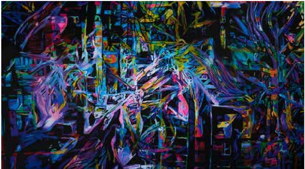
Figure 3. Art work 3

Idea / Concept: The work presents a colorful scene of a modern city in an atmosphere of artificial light. The excitement of modern urban areas is interesting with the interaction and connection between the lines and blocks that bring the breath of the technology city. Artistic form and style: The artist uses a close-up view of the main facade of the block, the structure of the buildings, but is combined and interwoven with lines and colors inspired by the elements of Urban areas such as electricity systems, streets and various machinery create depth and strong illusions.