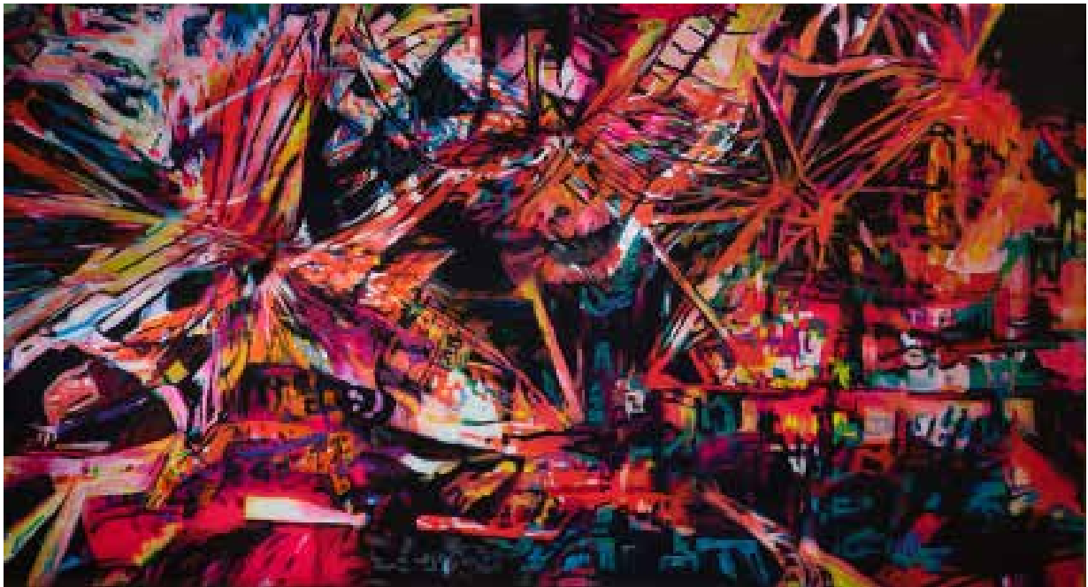
Figure 4. Art work 4

Form and Art style: The image of the city mixed with artificial light under the panoramic view along with soft curves and diagonal lines creates a magical feeling.