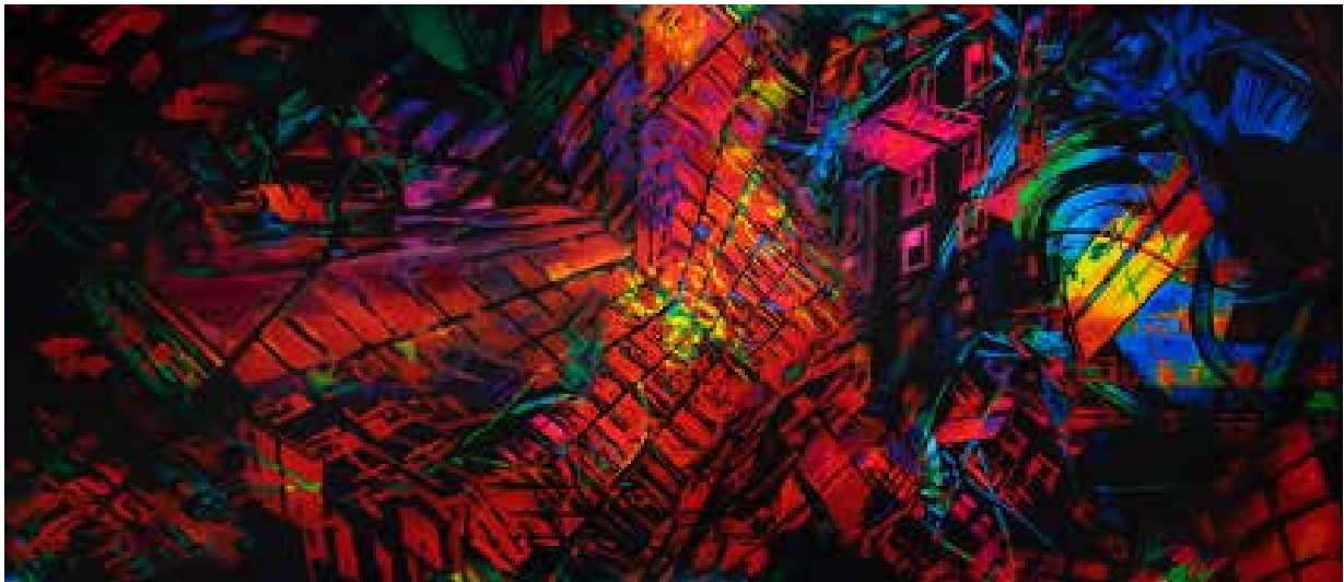
Figure 2. Art work 2

Idea / Concept: The content depicts vibrant and colorful urban life, with different spatial layers expressing strong emotions and enthusiasm in the fast pace of life in modern cities where machines and technology bring about dramatic changes in people's lives. Artistic form and style: The shapes of buildings from a multi-dimensional perspective with the appearance of high-rise blocks are arranged in many directions and abstracted with diverse lines and vibrant colors create depth and illusion.