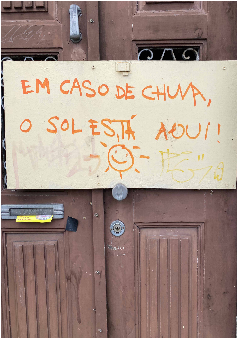
Figure 9. O sol. Location: Rua da Constituição. Coord.: 41,16281 N, 8,611871 W