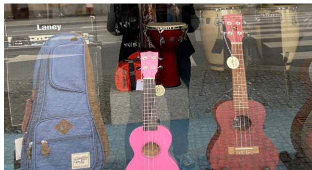
Figure 4. Laney. Location: Rua da Constituição. Coord.: 41,16165 N, 8,60152 W

(A skull face and another figure in blue). War text. Vortex. Of letters. Off. It is not normal to be afraid To walk alone on the street. Or laugh. Some choices of guitars, the pink one is the smallest. Está, eesta, esta. Paz. Capacidade. More blue figures. Tightly together. My name is hot.