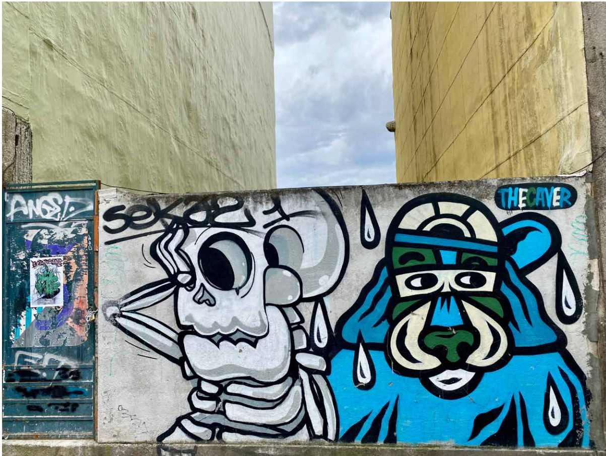
Figure 3. Angst. Location: Rua de Santos Pousada. Coord.: 41,15838 N, 8,59878 W

Watch the juggler on the crossing As he drops a ball or two time And again. The angst, the tears, and Saudade . An image by somebody Named "the Caver".