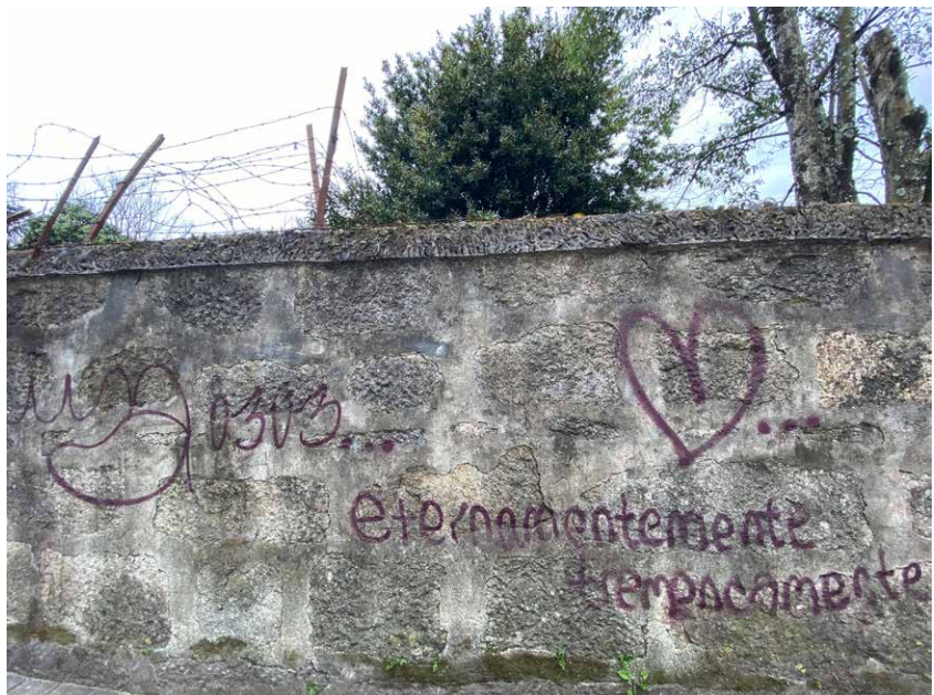
Figure 1. 0303. Location: Rua de Latino Coelho. Coord.: 41,16004 N, 8,6033 W