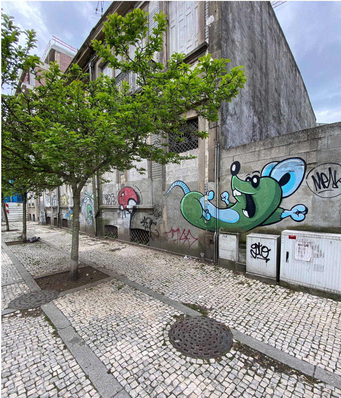
Figure 8. M. Location: Rua de Faria Guimarães. Coord.: 41,16209 N, 8,60701 W