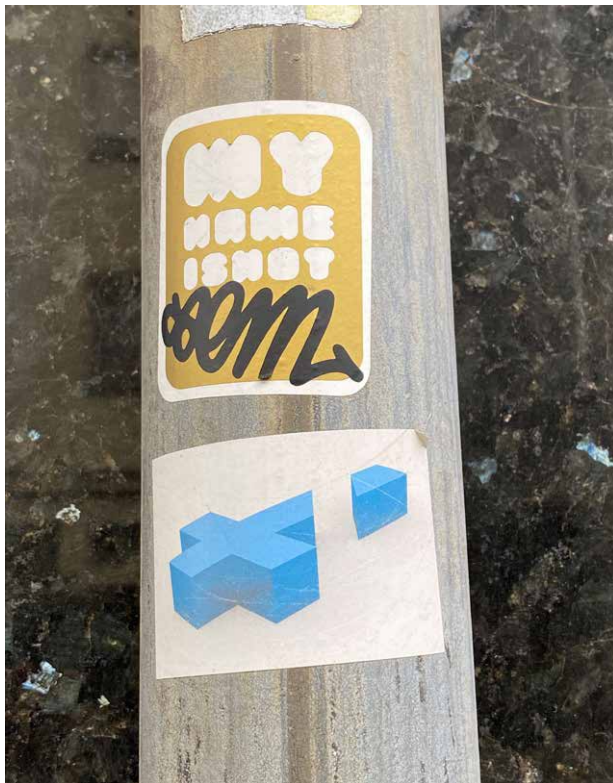
Figure 5. My name. Location: Rua da Constituição. Coord.: 41,16185 N, 8,60362 W