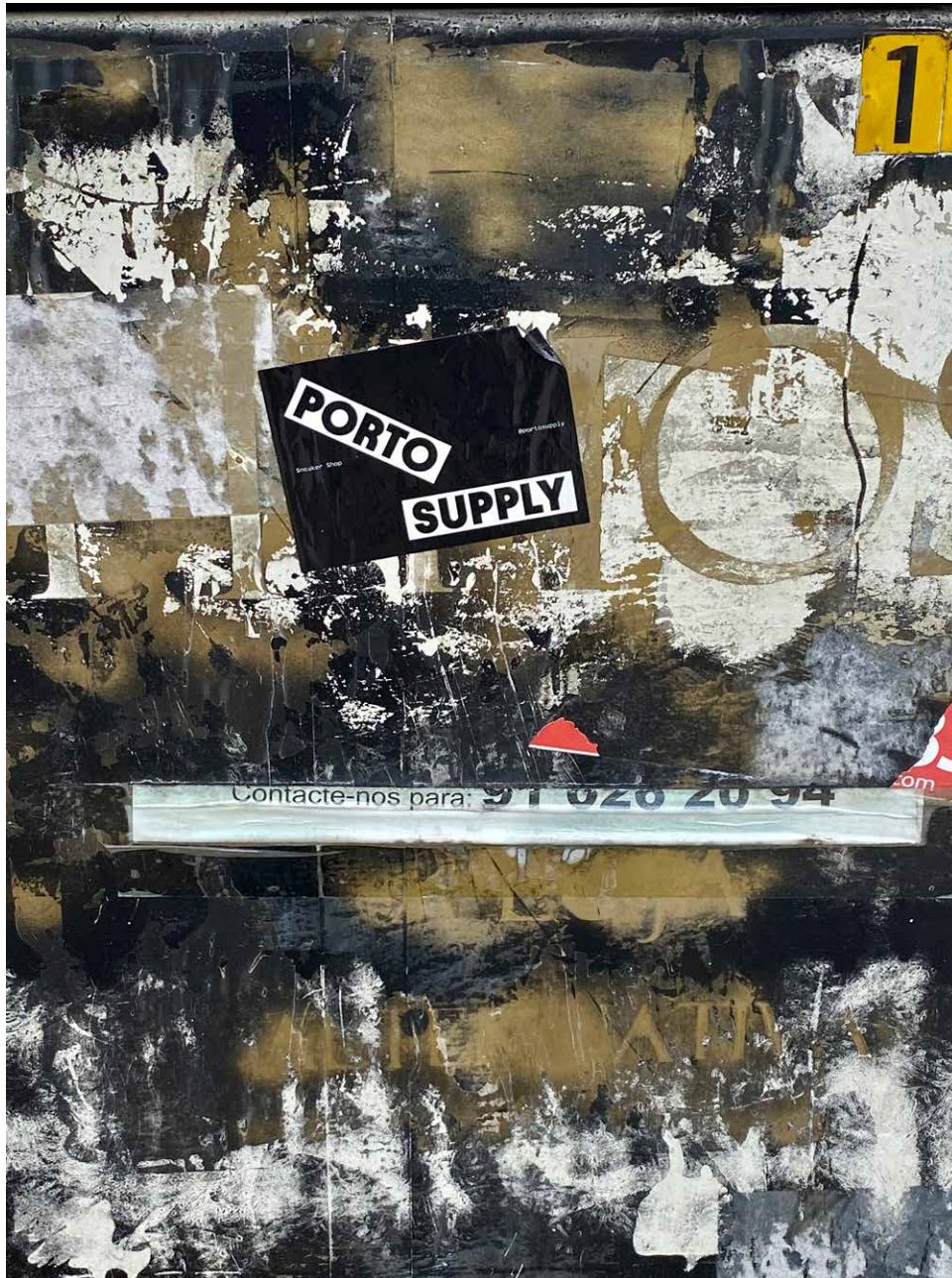
Figure 2. Contacte-nos . Location: Rua de Latino Coelho. Coord.: 41,15918 N, 8,59954 W

“Lule” means “floral” in Albanian. Screw this speculation. Close the gyms and teach Personal defence. This is THE street we Saw each other for the first time. Contact us.