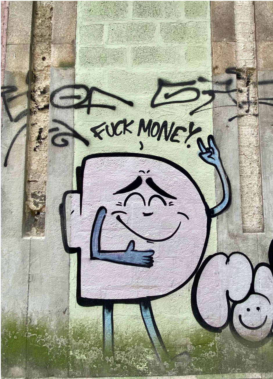
Figure 7. Get likes. Location: Rua da Constituição. Coord.: 41,16235 N, 8,60740 W

Recharge the energies. Hoje Fasco por mim. Are you Suffering from eviction? Fuck money, get likes! And go To Clube de Campismo do Porto . Buy socks. Or stocks. And smile. Luster. Faces of the security.