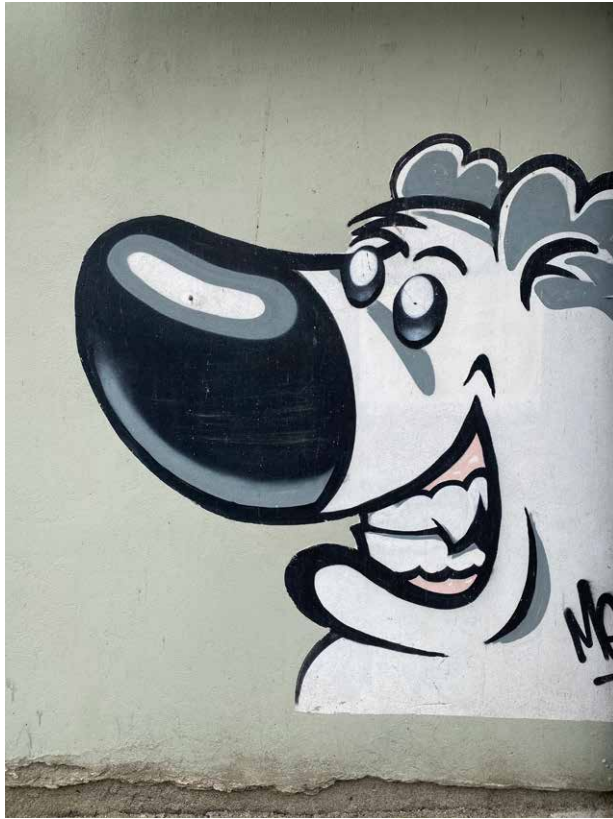
Figure 10. XXX. Location: Rua de São Brás. Coord.: 41,16254 N, 8,60912 W